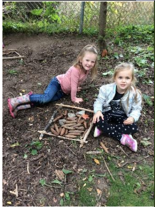
FDK Magic Tree Ephemeral Art