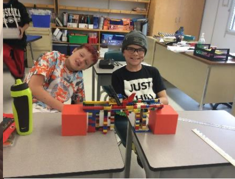
Bridge and Glider Challenge